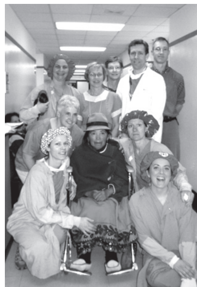
Surgical team poses with Equadorian patient.