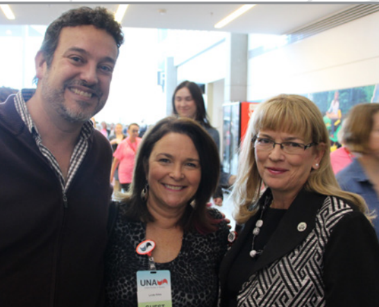
Scenes from the 2017 AGM