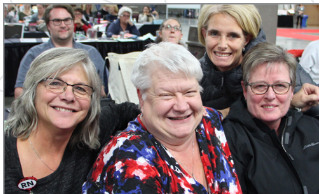
Scenes from the 2017 AGM

The page can be accessed through the federation's website, afl.org . 🍷