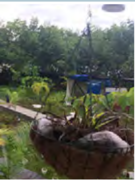
Photos from the 2018 Young Nurses Take Action mission to Coastal Panama.